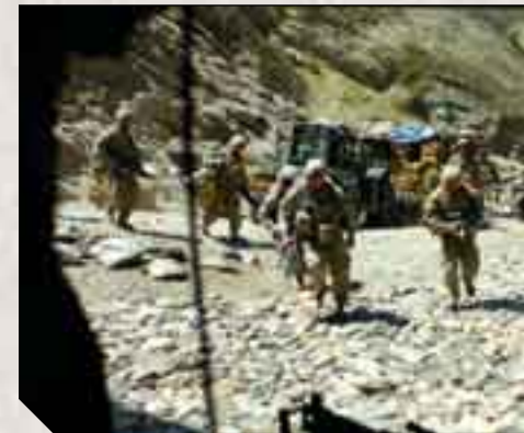
C Company, 3rd Squadron, 17th Cavalry Regiment, 10th Mountain Division. Right: Troops make their way down a mountain to board a CH-47 at observation post Copenhagen, Afghanistan, to move to another Observation Post. Left: A soldier hooks two water pallets to a CH-47 to sling-load to soldiers at combat operation bases in northeastern Afghanistan.