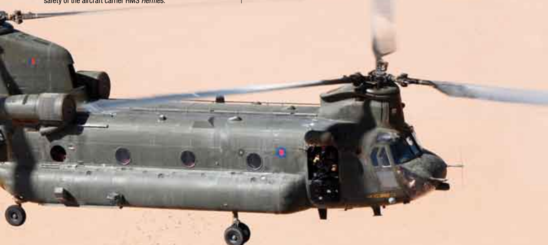
Chinook (ZA718) Bravo November seen in April 2007 over The Red Desert on the way from Kandahar to Camp Bastion in Helmand Province Afghanistan