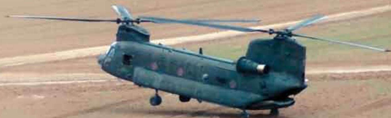
Iraqi and coalition soldiers run to the back of a CH-47 Chinook that has just arrived to take them back to base. The helicopter is one of several crewed by pilots and soldiers from 3rd Brigade, 25th Aviation Regiment that provided air transportation to get the troops into and out of their objective.

In the dark, just-above-freezing morning air, the troops practiced running onto the aircraft and taking their seats and then rushing out again.